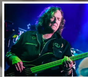
with special guest Stuart Hamm

This course will give bass players the tools to tackle all musical styles including Funk, Rock, Pop, Blues, Jazz and much more using a broad range of technical skills on the bass including soloing, slap, walking, writing wicked bass lines, fretless technique, two hand tapping, and playing killer grooves. Topics will include maximizing your groove, interacting with the soloist (making them sound good), writing your own bass lines, total fretboard knowledge, learning all modes of the major and minor scales, soloing on any scale, riff development, pentatonics, symmetrical scales (diminished and whole tone), and much more. All topics will be applied to multiple musical styles, and is not limited to any one style, taste, or interest. This course will be designed for beginner to advanced students alike and will take your bass playing to the next level. Students in this course will enjoy a very special visit from legendary bassist, Stuart Hamm!