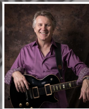
with special guests Joel Hoekstra and Rik Emmett