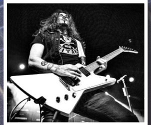
with special guest Phil X

This seminar will give you the tools to create your own style. Influences are important in a player but learning to cut your own path will give you longevity and get you noticed amongst your peers and listeners. Topics include creating your own guitar lines and phrases by thinking outside of the box and breaking stale practice routines of scales and chords, being able to move freely around the guitar when chording and creating riffs, user friendly theory that can be applied right away, fretboard visualization, and target notes. Techniques such as legato, tapping, economy, alternate, and sweep picking will also be covered. There will be lots of in class jamming and plenty of examples that you can take home and practice. Bon Jovi guitarist Phil X will visit and work with this class!