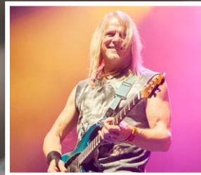
with special guest Steve Morse

Perfect for the rock player looking to take their playing to the next level, this course will analyze the styles of some of the leading players in this genre such as Eddie Van Halen, Randy Rhoads, Joe Satriani, Paul Gilbert, Steve Vai, and John Petrucci. This seminar will cover topics such as speed, tone, phrasing, arpeggios, and modes. Various technical aspects will be covered including sweep picking, hybrid picking, tremolo technique, harmonics, tapping, double tapping, developing speed while maintaining accuracy, legato development, string skipping, and odd groupings using alternate picking.. Theoretical concepts including pentatonic and diatonic scales, arpeggio/chord construction, harmony, the use of chords and chord progressions, and fretboard visualization are also covered. Students will be thrilled when guitar virtuoso Steve Morse visits and works with this class.