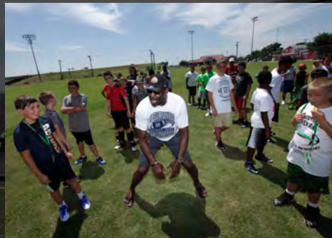
MICHAEL IRVIN Former Wide Receiver Dallas Cowboys