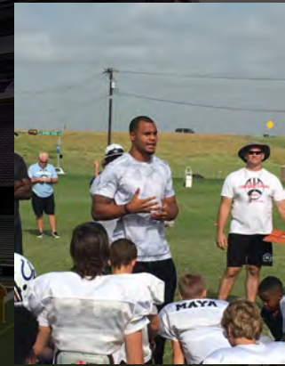
DAK PRESCOTT Quarterback Dallas Cowboys