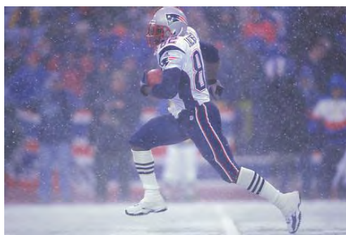
2024 Featured Instructor Curtis Jackson Former NFL Wide Receiver

(Overnight price: $649 or Day Price: $549) Ages 7 – 18